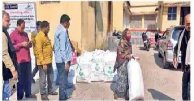
सिटी रिपोर्टर। हरनौत