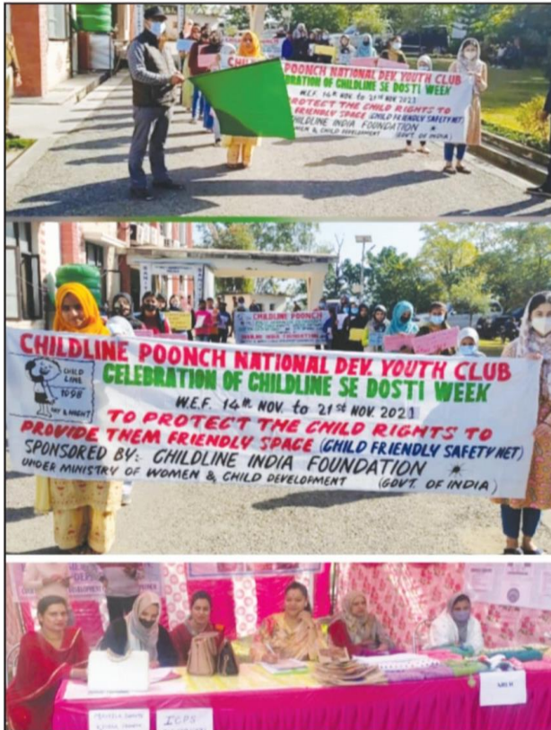
PT NEWS SERVICE ROZIA KAZMI

Today CHILDLINE Poonch organise an awareness rally about child rights on the occasion of CHILDLINE SE DOSTI WEEK to celebrate children day